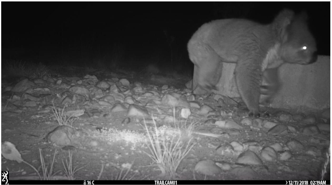
Koala in Pinkerton

Pinkerton Link: creating a wildlife corridor connecting two remnant Grey Box Woodlands Community Volunteer Action Grant 2015: Threatened Species Grant to protect Diamond Firetails