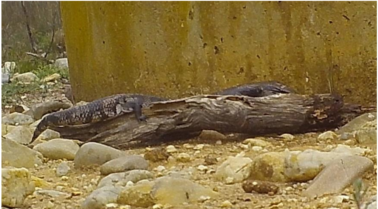
Common Blue-tongue Lizard