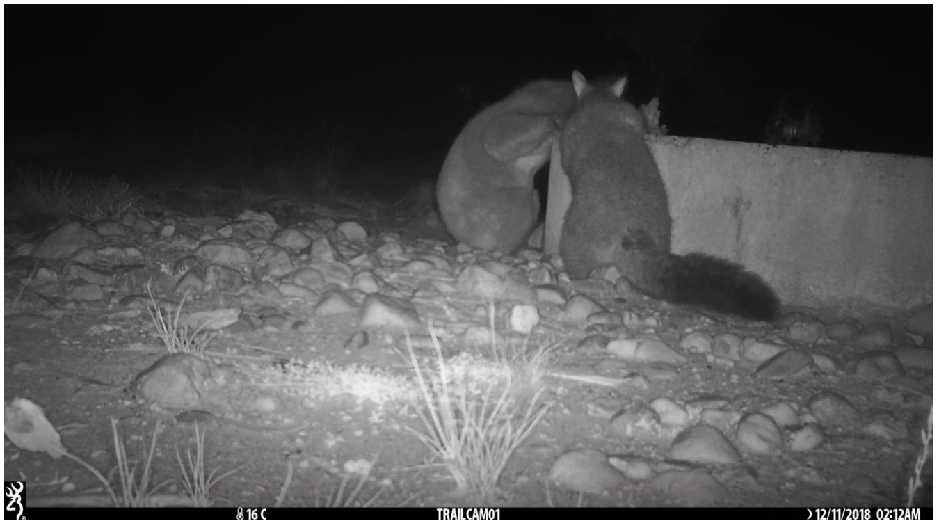
Koala in Pinkerton

Pinkerton Link: creating a wildlife corridor connecting two remnant Grey Box Woodlands Community Volunteer Action Grant 2015: Threatened Species Grant to protect Diamond Firetails