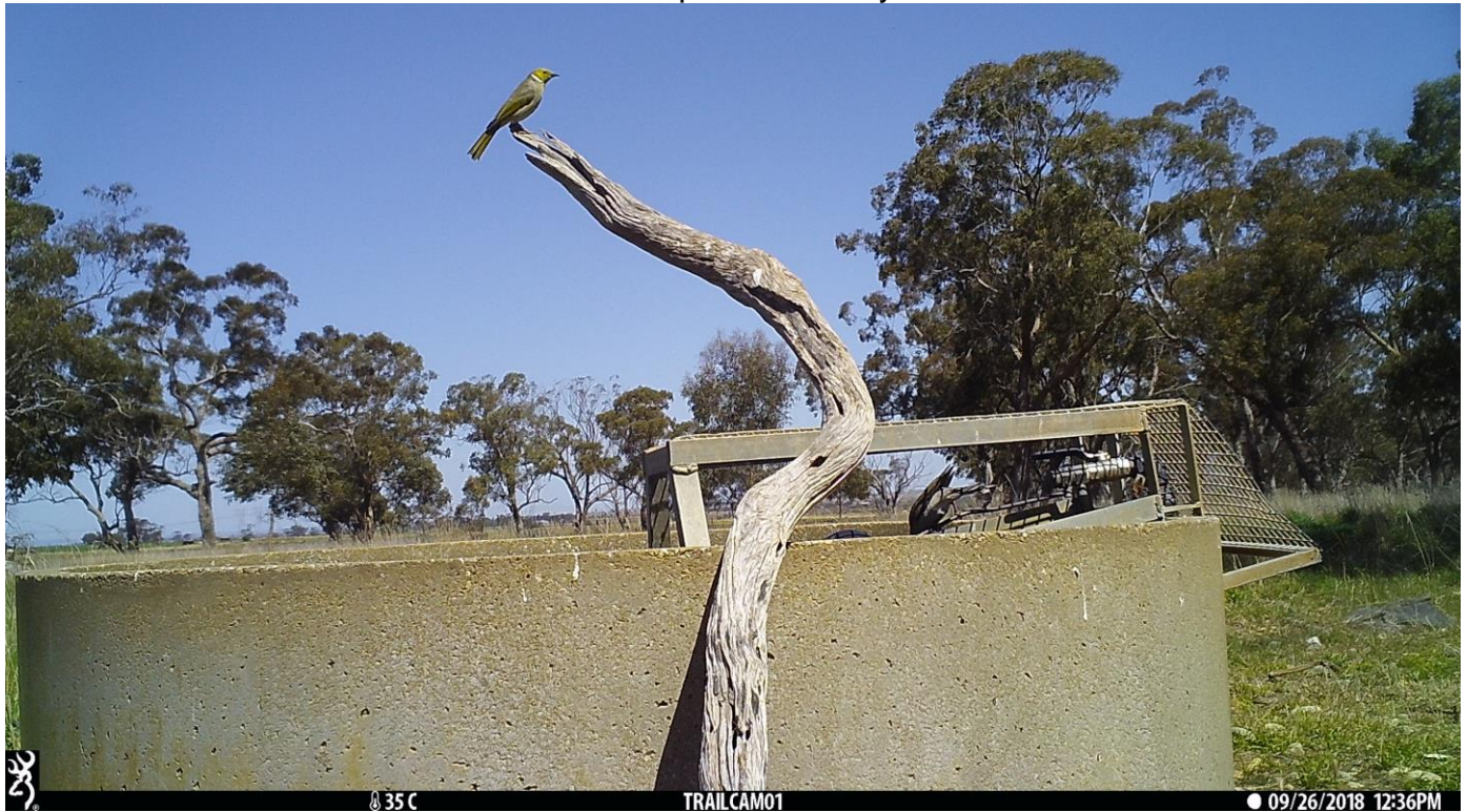
White-plumed Honeyeaters & Noisy Miner

Pinkerton Link: creating a wildlife corridor connecting two remnant Grey Box Woodlands Community Volunteer Action Grant 2015: Threatened Species Grant to protect Diamond Firetails