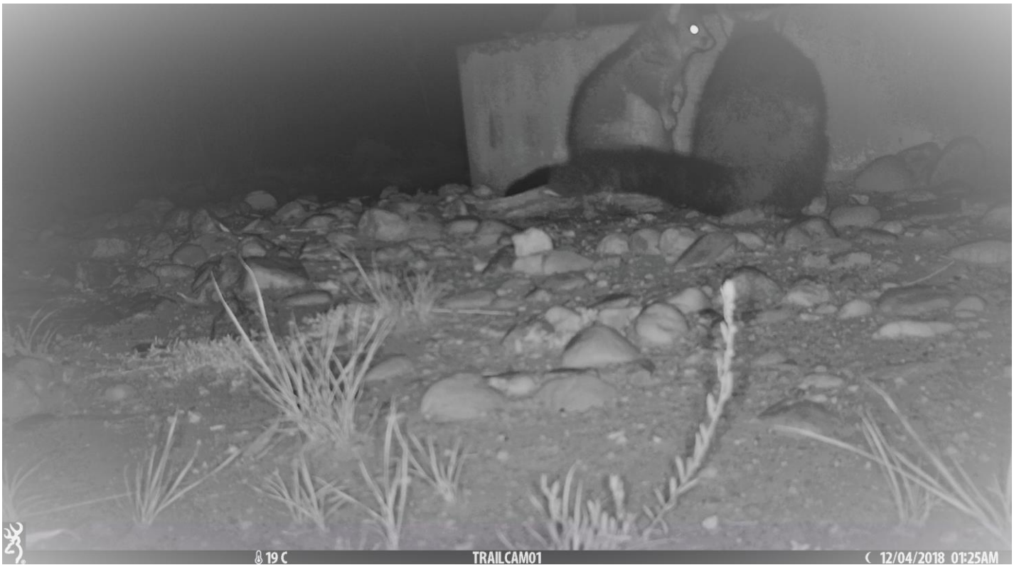
Brush-tailed Possum and young