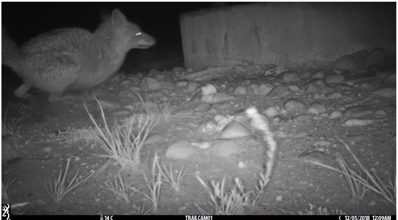
Fox chasing Possum in Pinkerton

Pinkerton Link: creating a wildlife corridor connecting two remnant Grey Box Woodlands Community Volunteer Action Grant 2015: Threatened Species Grant to protect Diamond Firetails