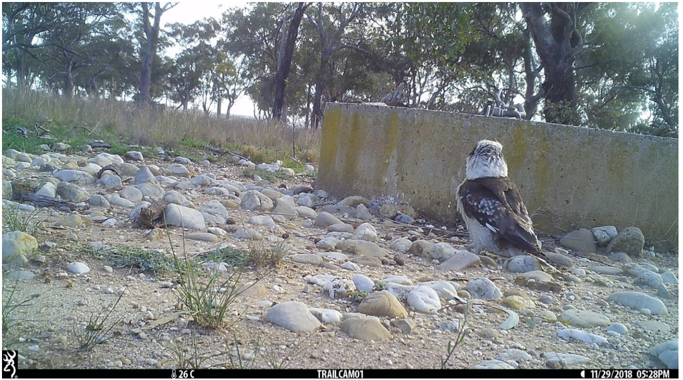
Kookaburra in Pinkerton