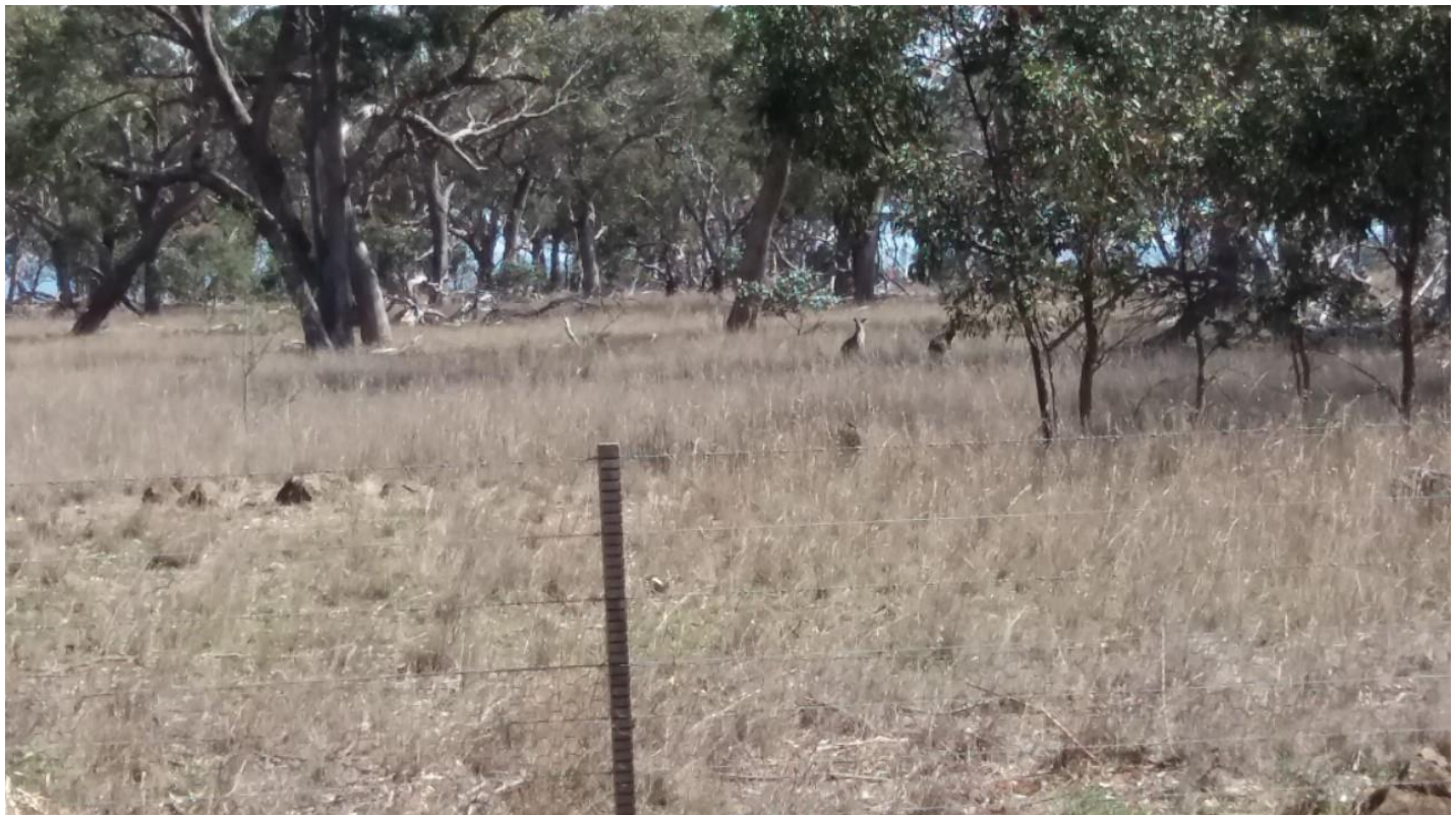
Grey Kangaroos in Pinkerton Forest

A series of photos were taken by a trail camera at the two water troughs placed in Pinkerton Forest (beside the Green Shed & in Upper Pinkerton) as well as beside the Pinkerton Link / Mulla Mulla gate giving us an insight as to what happens in Pinkerton in our absence! We have also had a glimpse into night time activities in Pinkerton. The water troughs appear to be a focus of activity, both day and night. The trough beside the Green Shed especially is a focus of activity for a variety of local wildlife (native and non-native). A dramatic incident recorded a Fox in pursuit of a Possum beside the water trough. Fortunately both the possum and its young were photographed the following night so they both survived the chase!