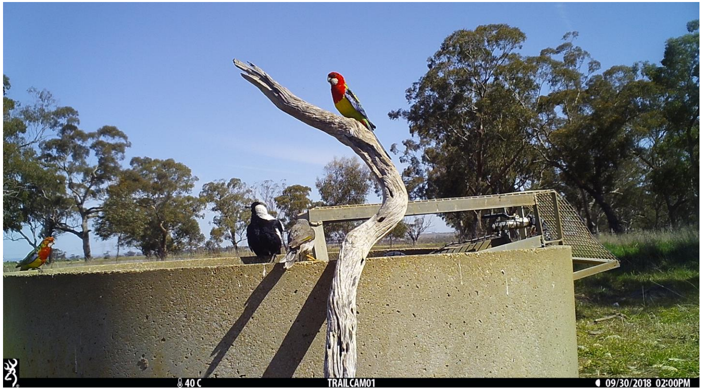
Eastern Rosellas, Magpie &amp; Noisy Miner

Pinkerton Link: creating a wildlife corridor connecting two remnant Grey Box Woodlands Community Volunteer Action Grant 2015: Threatened Species Grant to protect Diamond Firetails