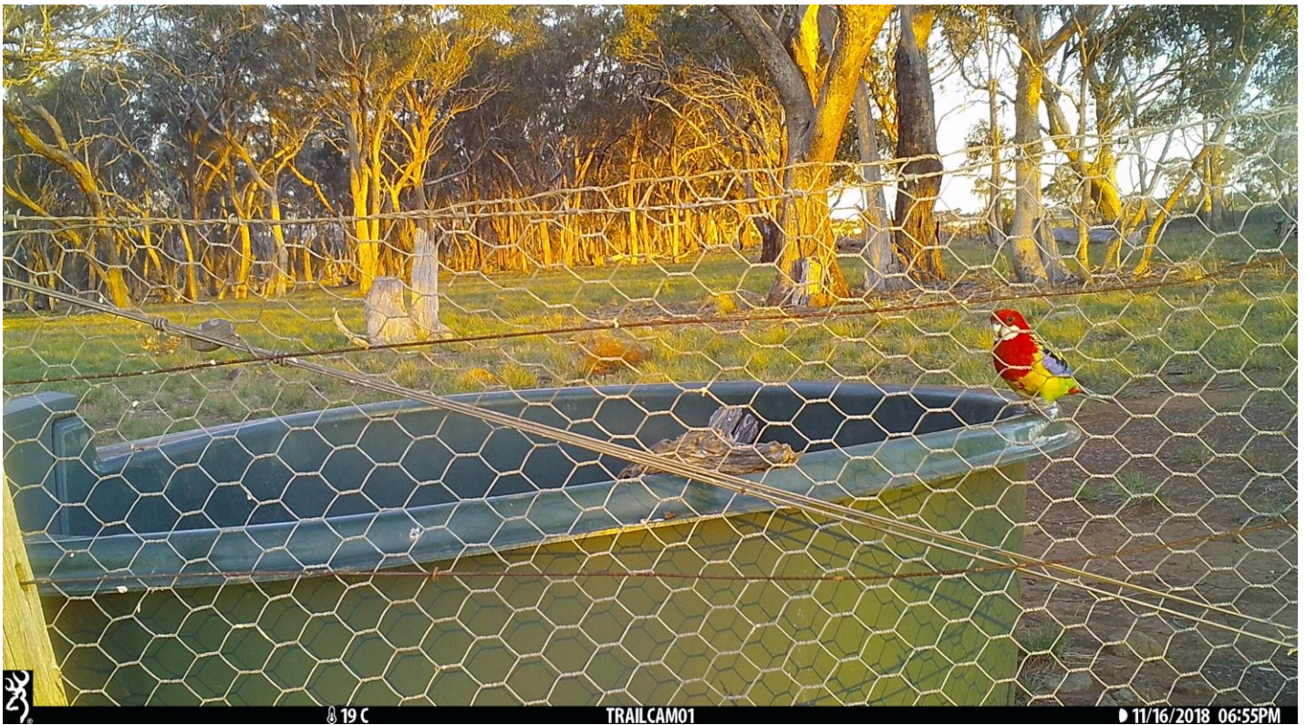
Eastern Rosellas at Mulla Mulla gate at sunset