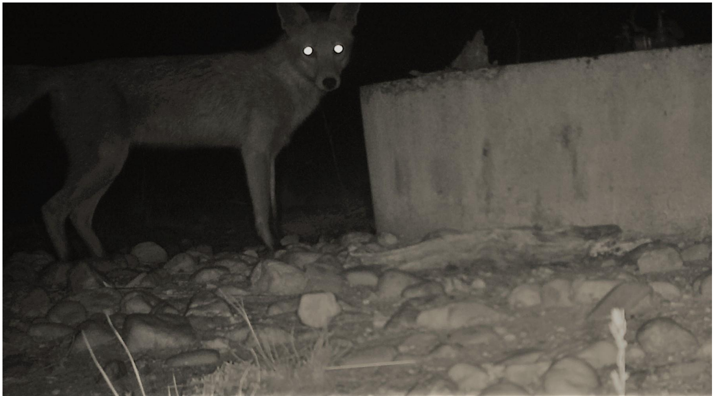
Eyes in the dark

Pinkerton Link: creating a wildlife corridor connecting two remnant Grey Box Woodlands Community Volunteer Action Grant 2015: Threatened Species Grant to protect Diamond Firetails