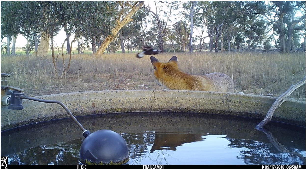
Fox swooped by Magpie