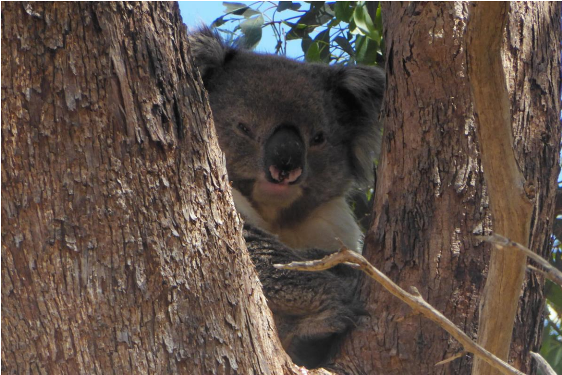
Koala beside Pinkerton graves (photographed during working bee)