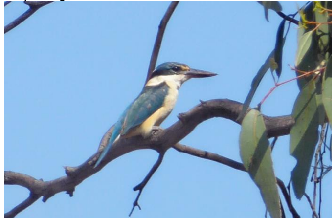
Sacred Kingfisher Brookfield late November 2017

A Sacred Kingfisher was seen on a Melton South clothesline at the end of September. They seem to like clotheslines. It then proceeded to forage in an adjacent Apricot tree, to the annoyance of the local New Holland Honeyeaters. These usually arrive in Melton in late October so this appearance was a bit surprising!