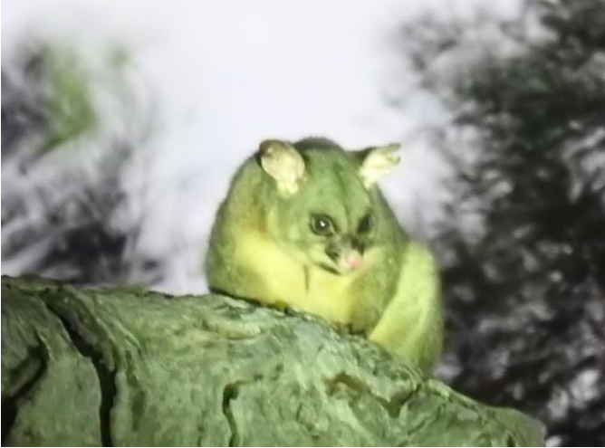
Brush-tailed Possum at Hannah Watts Park

We had to cancel our Possum Walks due to several year's Covid lockdowns. The walk is along a concrete footpath (no bushwalking in the dark!). We should be able to guarantee to see possums. Numbers of possums live in the Possum Tree and they emerge at nightfall to feed on picnic leftovers in the playground. This is a child (& elderly person!) friendly event, with possums (virtually) guaranteed. (sadly nothing in life is guaranteed!) Date & details TBA