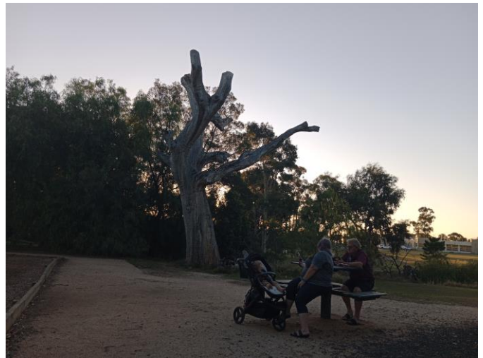
Possum Tree beside Toolern Creek.

Possoms in the bush are usually quite timid but in an urban environment they quickly become accustomed to human presence & have learned to forage on human scraps. This ability to adapt is obviously the secret of their success in managing to coexist with us in an increasingly urbanised environment. Instead of complaining about their presence in our gardens & neighbourhoods for eating the occasional rosebud we should be applauding them for their success in managing to coexist with us, in an environment that is becoming increasingly hostile to native wildlife. Especially as so many of our native mammals have become extinct, or are on the brink of extinction, due our destruction of the natural environment. Sadly, Australia leads the world in wildlife extinctions! Not a record in which we should take pride!! The success of our possums is something we should instead take pride in! The archetypal Aussie battlers!!